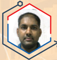
AIR 6 KOYA SHREE HARSHA