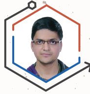
AIR 4 YASH JALUKA